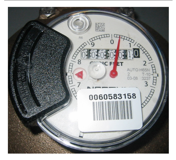
This is a Neptune 2" T-10 Register that reads in CuFt x 10 or 10 CuFt. Since the reading on this register is 10 Cuft, it would be rounded down to 0. If for example it read 34790 CuFt the VL-9 would read 3475 and you would need to add a zero to the reading for the multiplier.